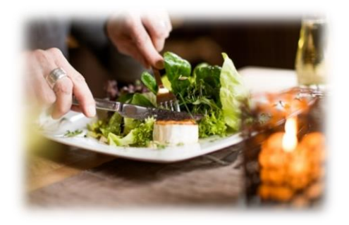
Enjoy a wonderful stay in our Hotel rooms